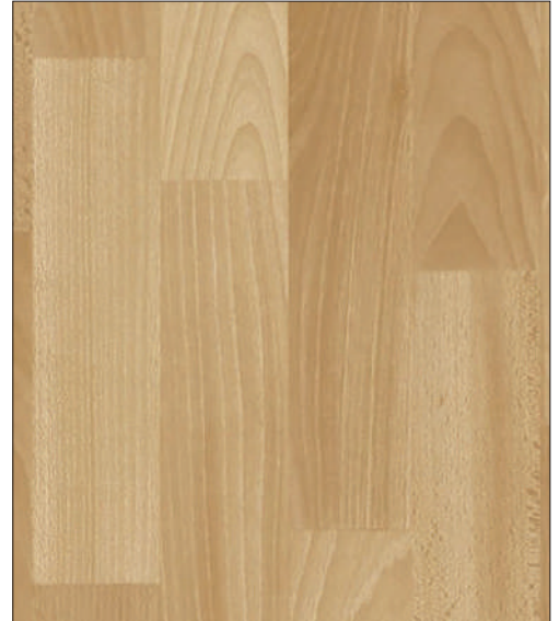
Natural 5618 001