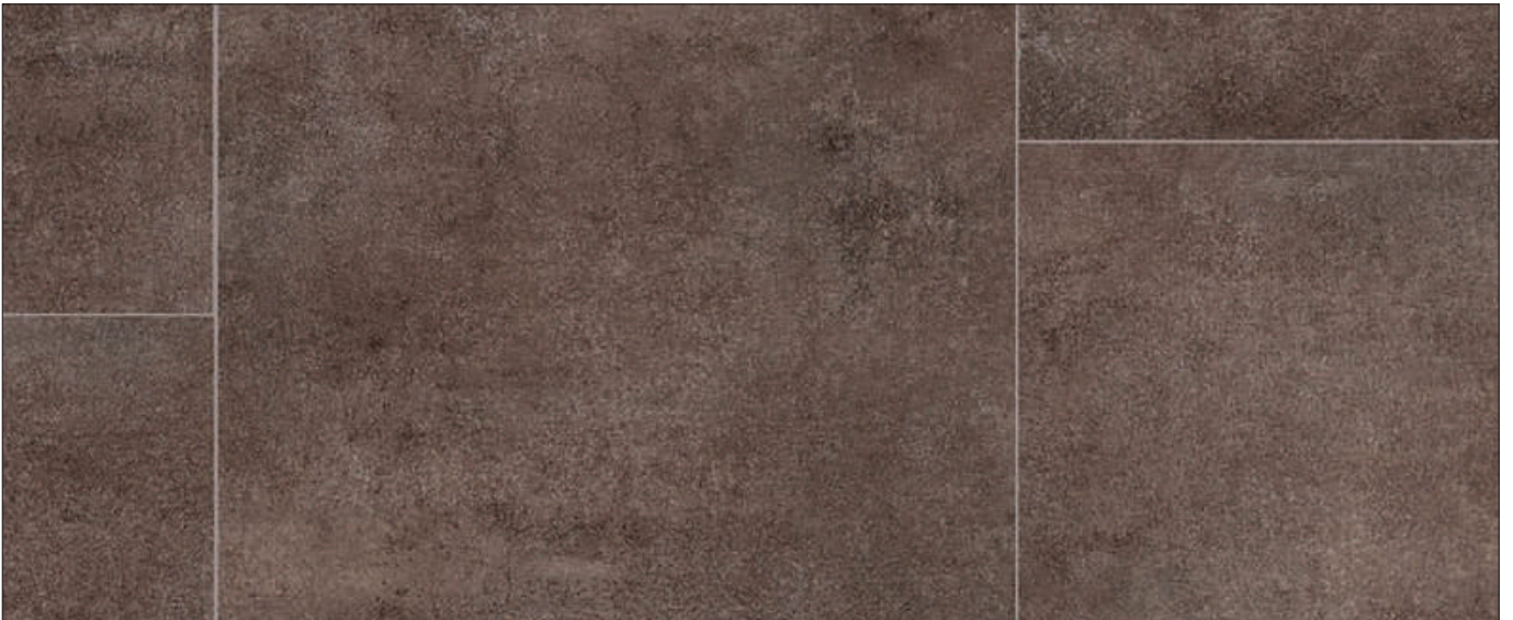
Black 5618 011