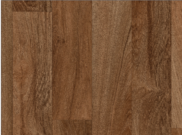
Brown 5618 005