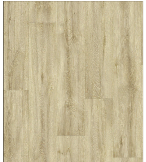
Natural 5618 051