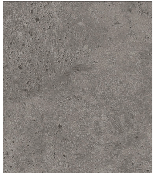
Smoked 5618 039