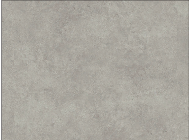
Grey Black 5618 020