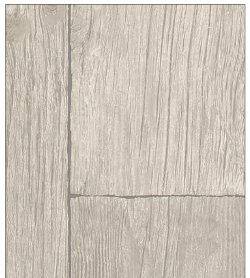
Silk Grey 5618 053