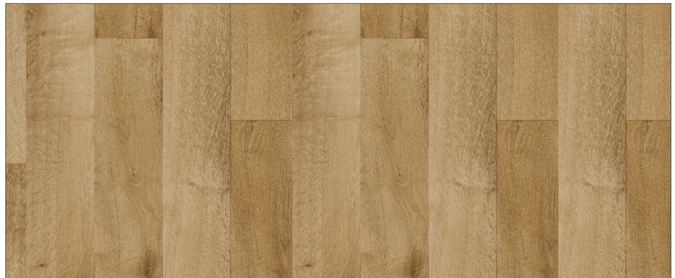
Light Brown 5618 003