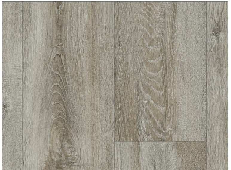
Grey 5618 048