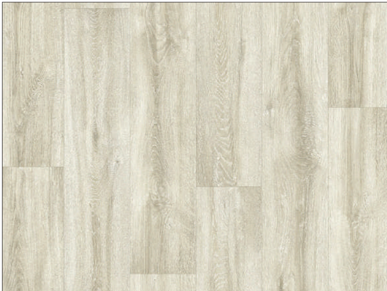
White 5618 050