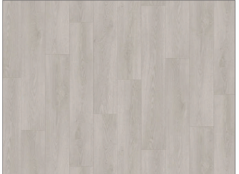
Light Grey 5618 046