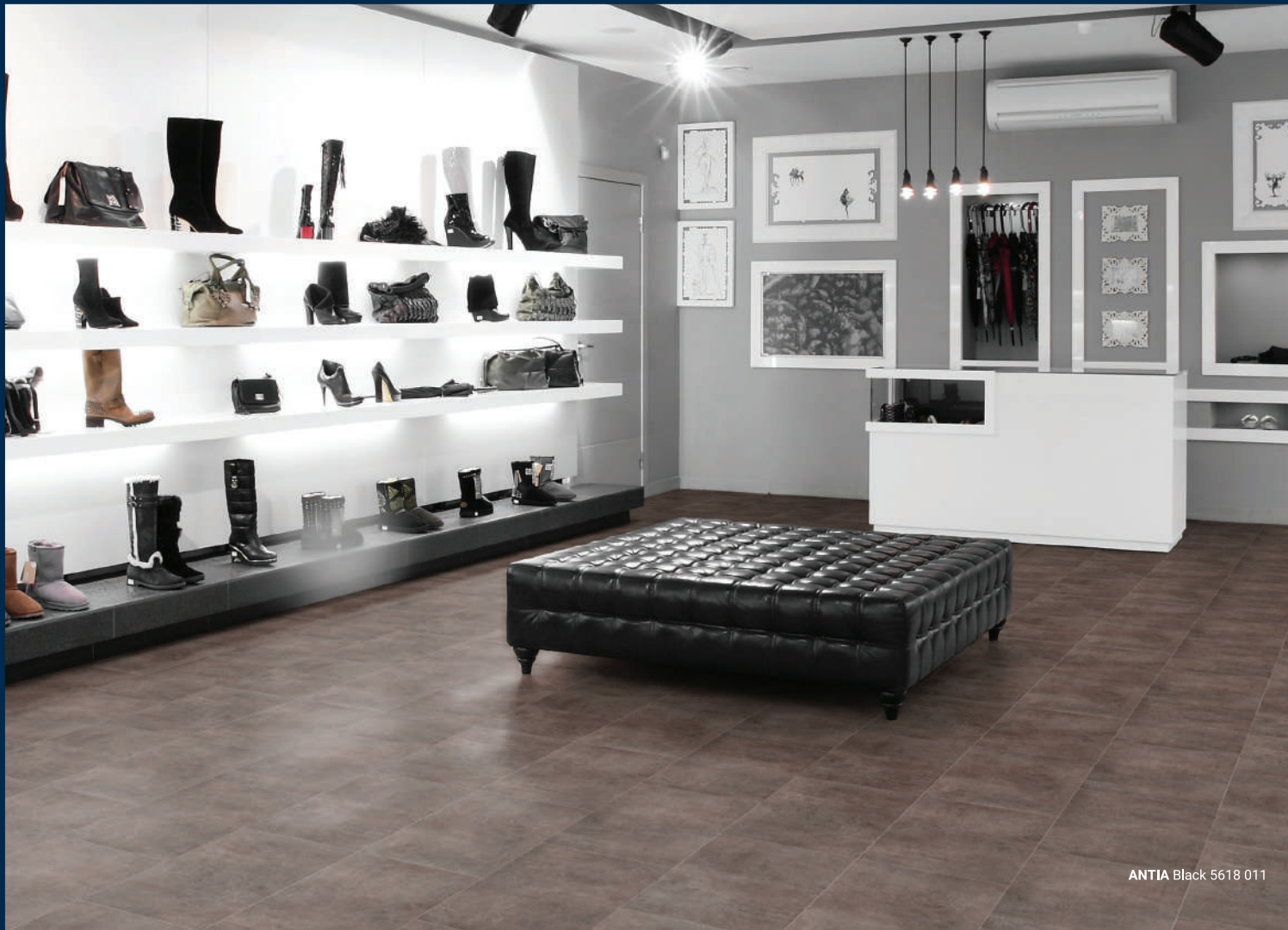
ANTIA Black 5618 011