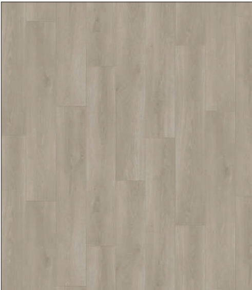
Light Brown 5618 042