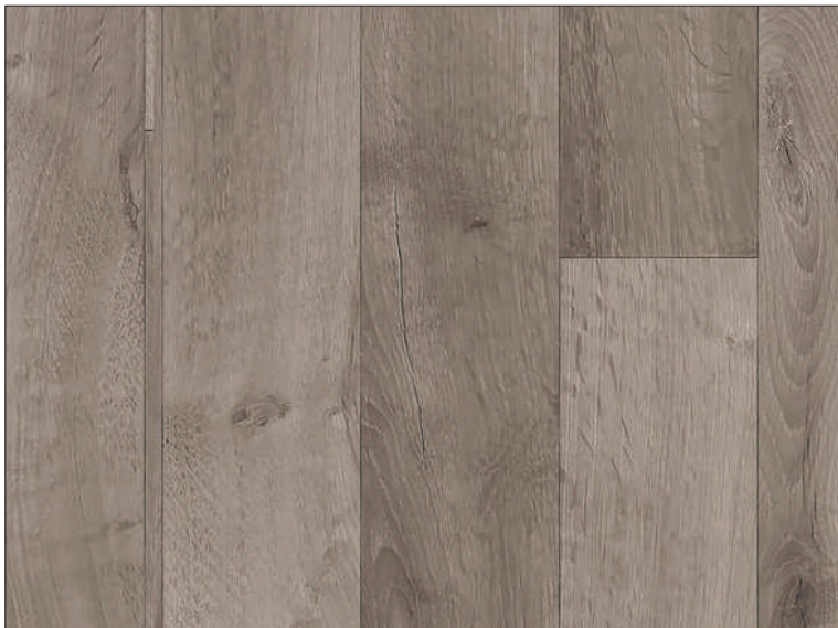
Smoked Grey 5618 040