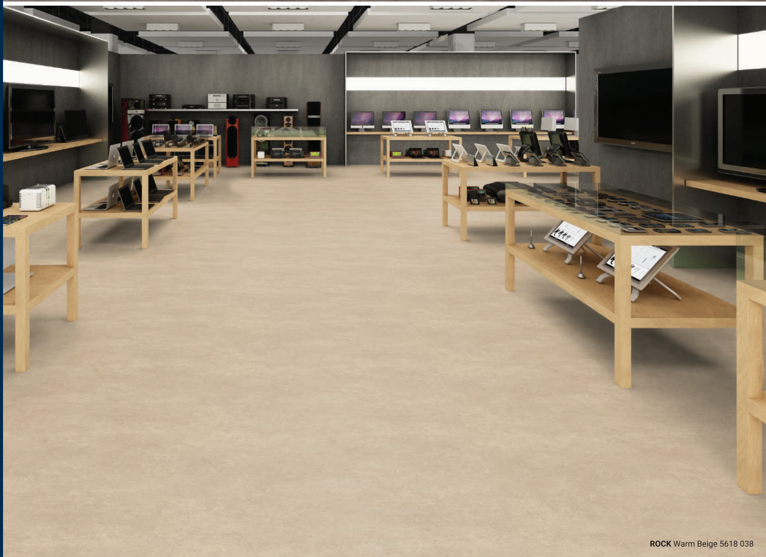
ROCK Warm Beige 5618 038