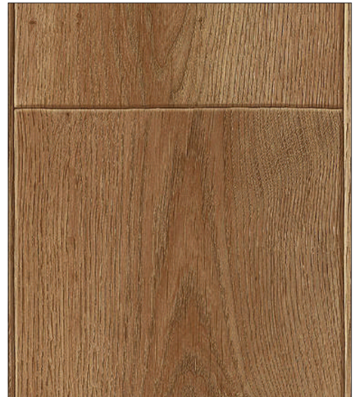
Warm Beige 5618 047