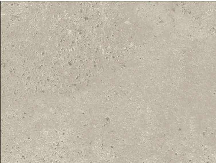
Warm Grey 5618 037