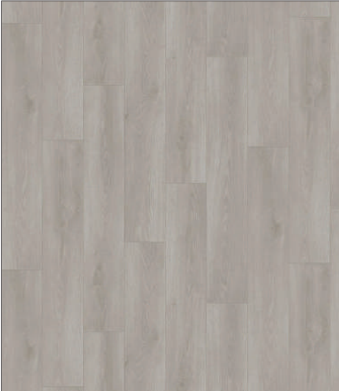
Cold Grey 5618 043