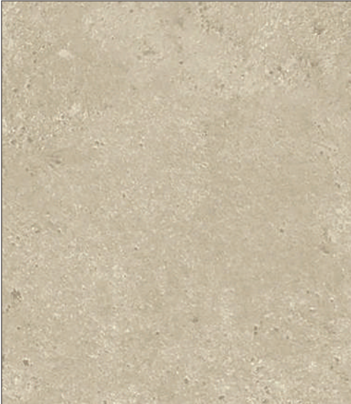
Warm Beige 5618 038