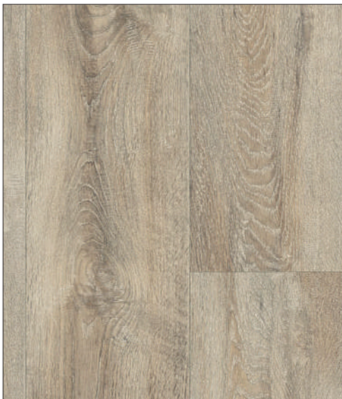
Light Grey 5618 049