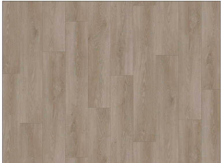
Warm Brown 5618 045