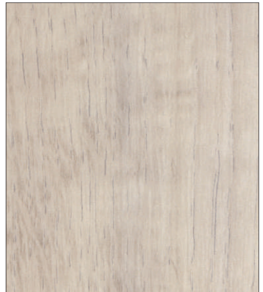
Light Warm Grey 5618 025